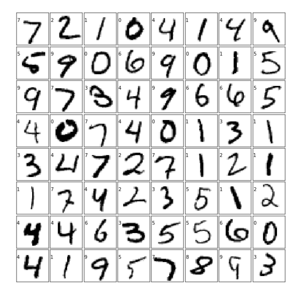
Figure 1. Random character samples from MNIST [5] dataset (28x28 pixels)

MNIST dataset; It was published as 28x28 pixels, formatted and preprocessed, composed of only numbers (60,000 training, 10,000 tests), written in the Latin alphabet by approximately 500 participants [5]. Handwriting is frequently used in number recognition applications. Some character examples from the MNIST dataset are shown in Figure 1.