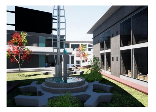
Figure 2. The exterior of a courtyard with nature