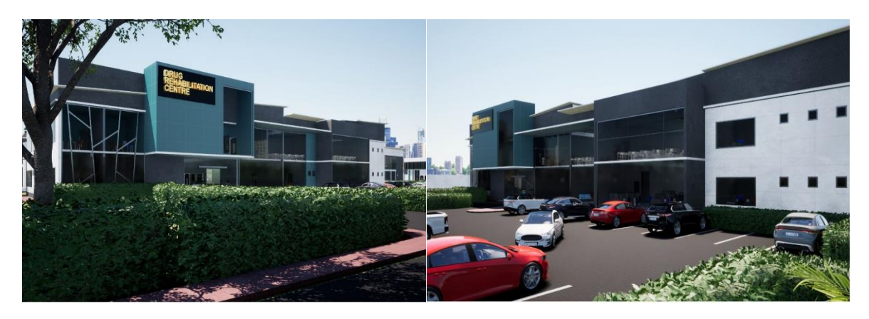
Figures 5 & 6. 3-D Exterior view of the Rehab Centre